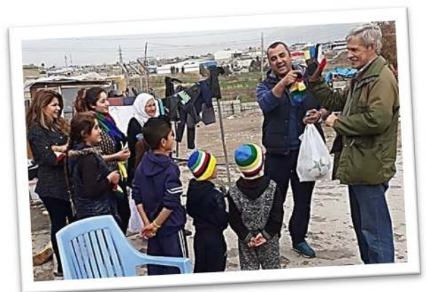
Telling stories to children

Contact: Global Relief, Loffie Schoeman, 0828758313